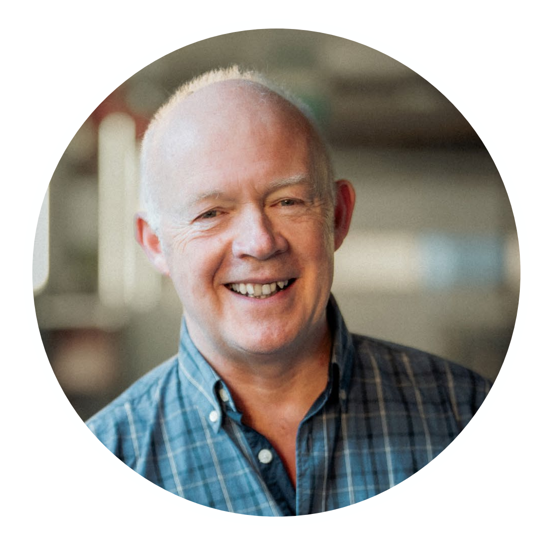
Jim Crowe EASPD